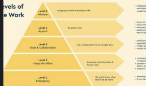
Blomberg's Five Stages of Remote Work